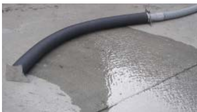
ATP40-Hydro Vacuum Arch