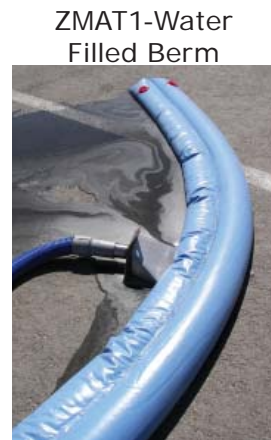
ZMAT1-Water Filled Berm