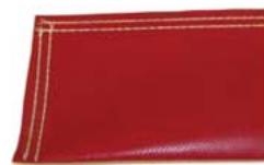
ZMAT6-Sand Filled Berm