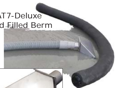
ZMAT7-Deluxe Sand-Filled Berm