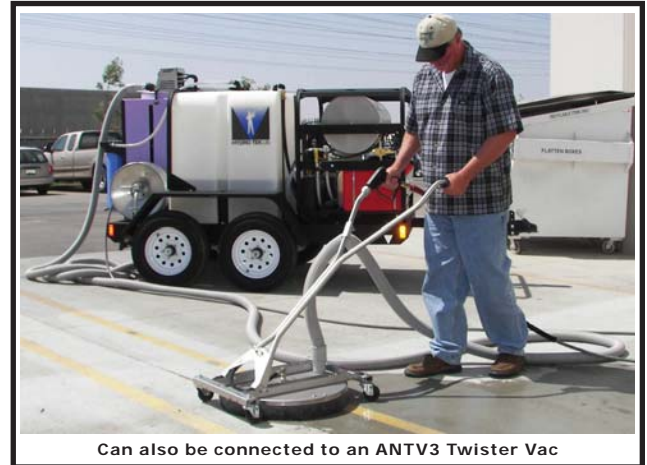
Can also be connected to an ANTV3 Twister Vac